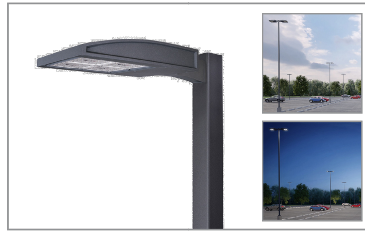
3 LABEL D LIGHT NOT TO SCALE

McGraw-Edison GALN Galleon II Area / Site Luminaire Product Features Light Architect™ BAA FADC