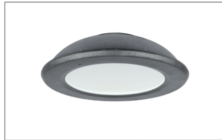
2 LABEL C LIGHT NOT TO SCALE

McGraw-Edison TTN TopTier Nano Parking Garage Luminaire Product Features BAA TAA