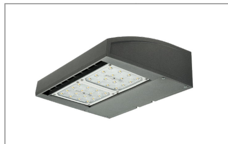
4 LABEL SA & SB LIGHTS NOT TO SCALE

McGraw-Edison GWC Galleon Wall Wall Mount Luminaire Product Features Light Architect™ BAA FADC